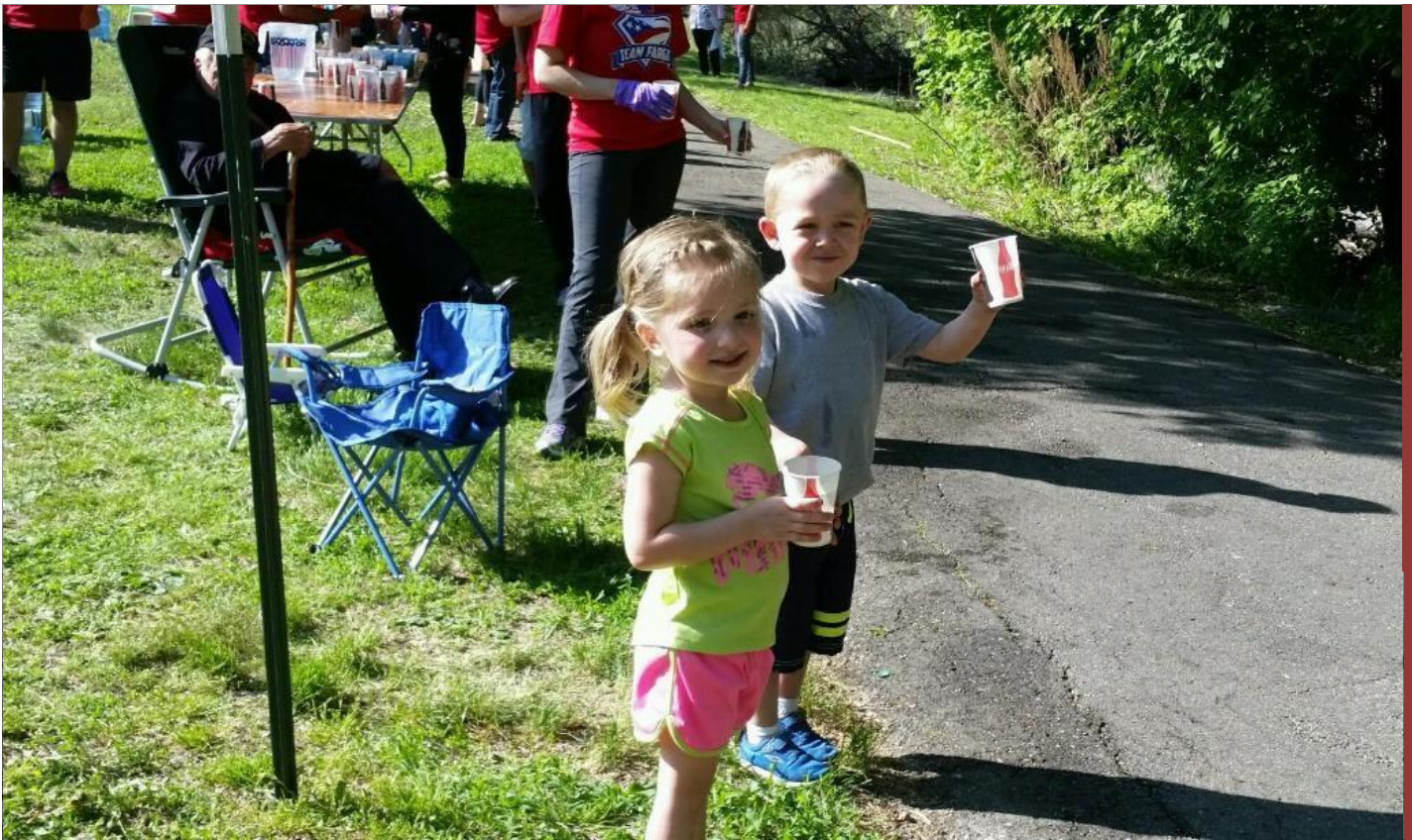
Helpers at the MBA aid station for the Fargo Marathon, May 21.